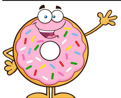
National Donut Day Friday, June 7th

Each year on the first Friday in June, people participate in National Doughnut or Donut Day, celebrating the doughnut and honoring the Salvation Army Lassies. The Salvation Army Lassies are the women who served doughnuts to soldiers during WWI.