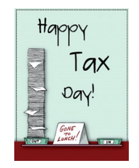
Monday, April 15th